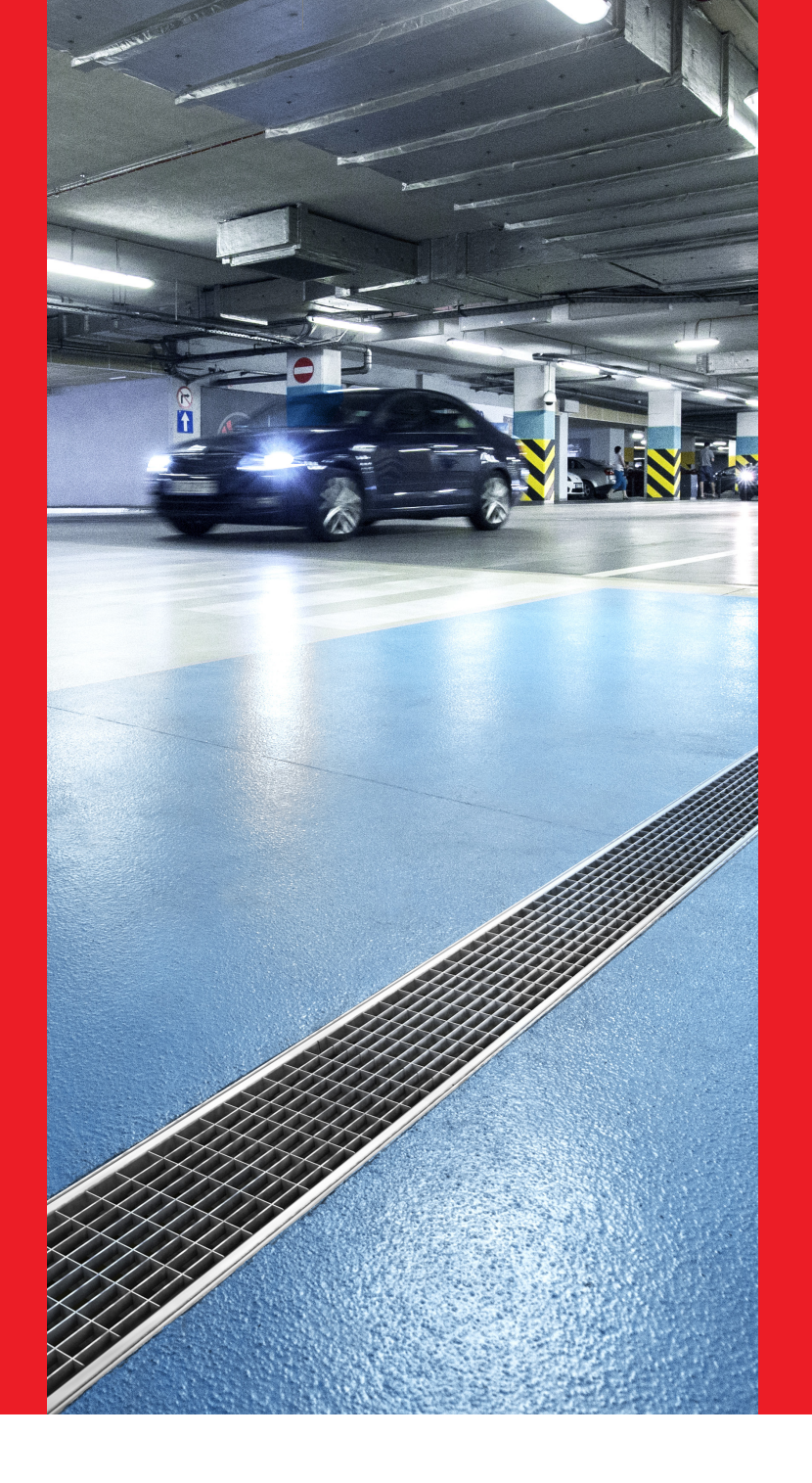
How to ensure proper drainage for a long lifetime?

ACO DRAIN® Deckline. Especially designed for parkdecks.