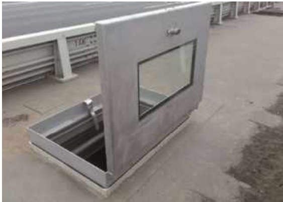
Small escape hatch that can be opened by hand