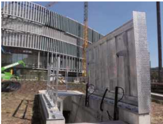
Hydraulic escape hatch – Frankfurt