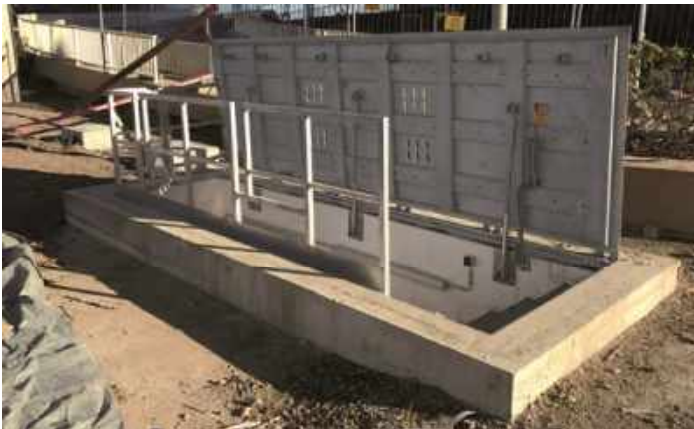
Floor hatch that can be walked on and comes equipped with an opening aid – Frankfurt