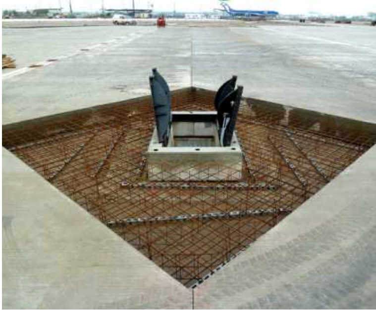
Prefabricated triangular cable shaft covers with a height-adjustable reinforced concrete frame and a load class of F900 – Frankfurt