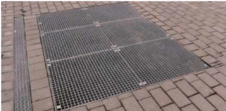
Six-piece grating cover – Frankfurt