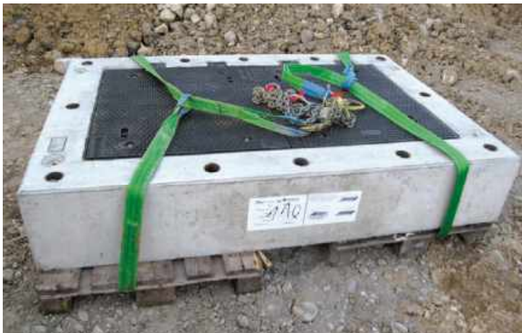
Prefabricated surface-water-tight cable shaft cover with a height-adjustable reinforced concrete frame and a load class of D400 – Biel, Switzerland