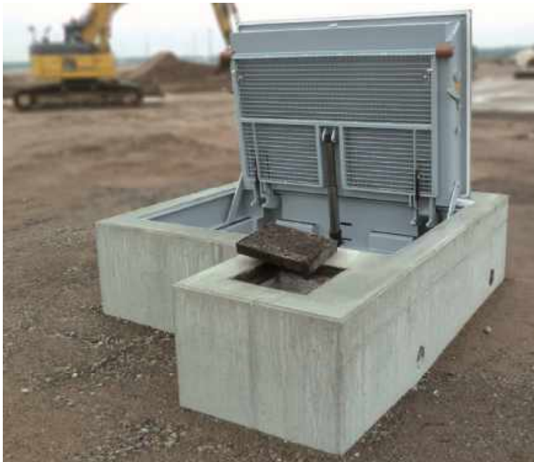
Hydraulic heavy-duty cover made from prefabricated reinforced concrete and with a load class of F900 – Frankfurt