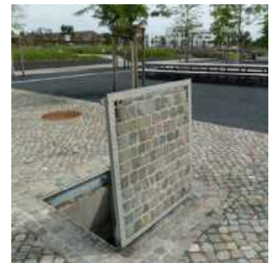
Cover with a paveable surface – Landau