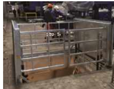
Hydraulic shaft cover as an assembly opening with anti-fall-in protection that can be driven on with a forklift truck – Krefeld