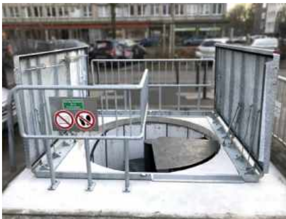
Escape hatch cover that is safe to walk on and can be operated manually – Essen