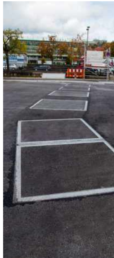
Backwater-proof covers filled with asphalt – Ansbach