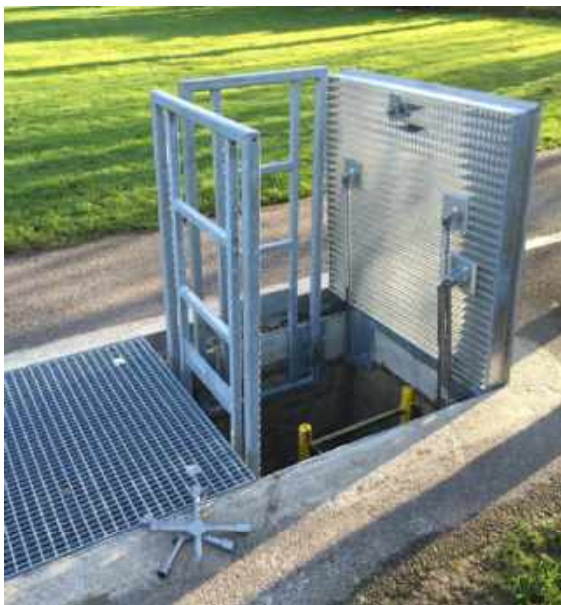
Escape hatch with a telescopically retractable grating – Leverkusen

The TÜV Süd technical inspection association has confirmed that our hydraulic shaft covers comply with the EC Machinery Directive and are suitable for use as escape hatches.