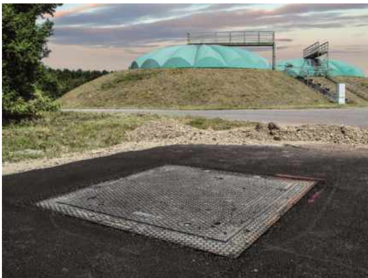
Surface-water-tight cast-iron cover with an opening aid, a load class of D400 and a clear opening of 1000 mm x 1000 mm – Munich