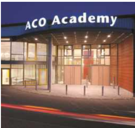
The ACO Academy offers practical training