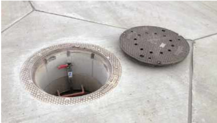
Cast-iron cover with screw-in locking lever fastenings, a load class of F900 and a clear opening of 800 mm