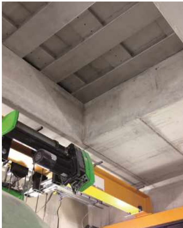
View from below of a floodproof cover on an assembly opening – power plant on the river Danube near Augsburg