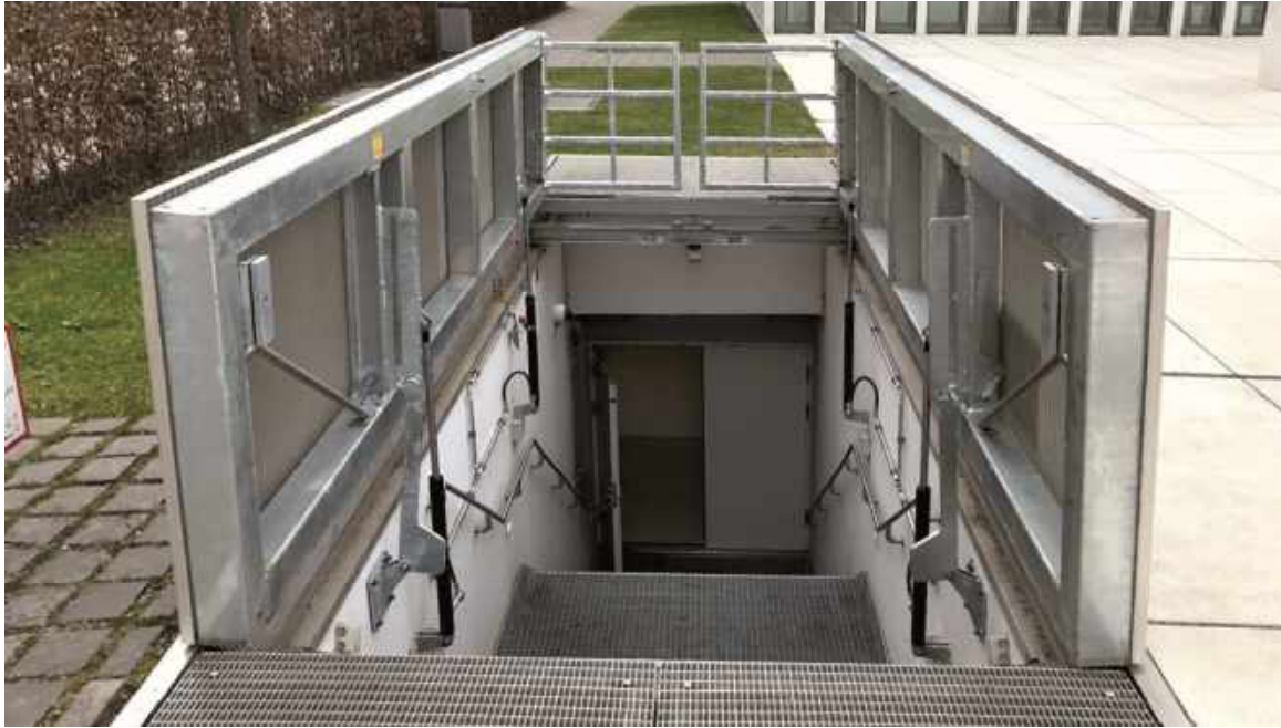
2-piece floor hatch as an emergency exit – Munich