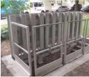
Three-piece cover with opening aid and folding guardrail – Frankfurt