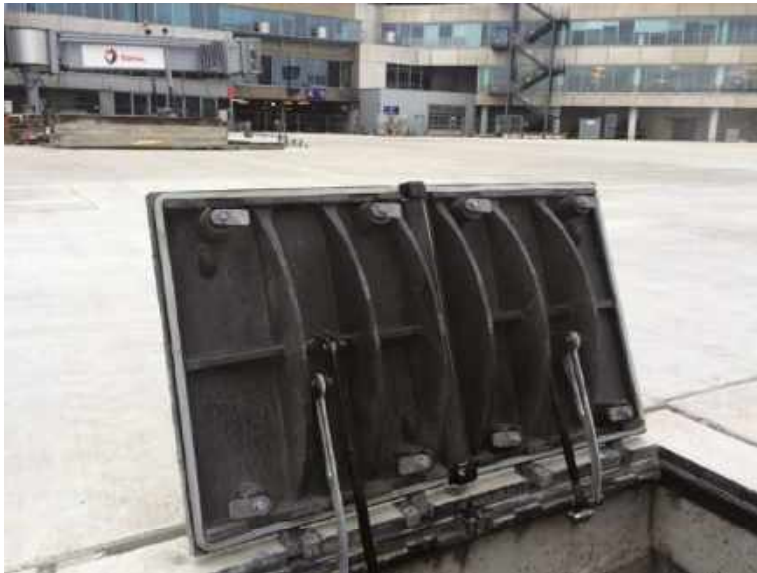
Surface-water-tight cable shaft cover with a reinforced concrete frame and a load class of F900 – Frankfurt

ACO Detego has a high-quality range of shaft covers that meet all requirements and at the same time are extremely operator-friendly.