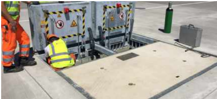
Three-piece cover with two inspection openings and a load class of F900