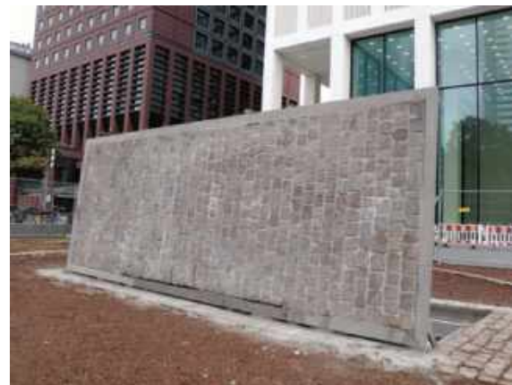
Escape hatch with paved cover – Frankfurt