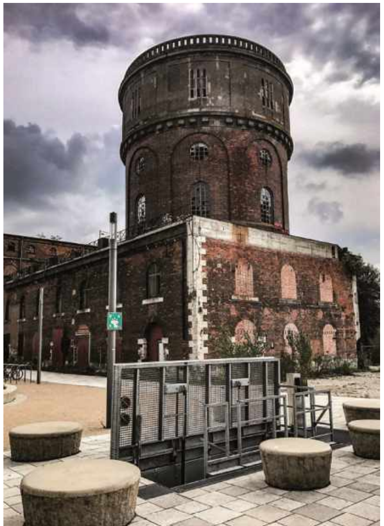
Escape hatch with a hydraulic drive and grating – Ingolstadt