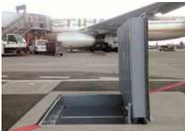
Heavy-duty cover with a load class of F900 – Geneva