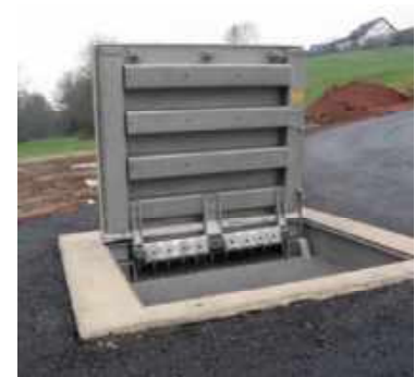
Cover with spring drive as an opening aid, – Saarlouis