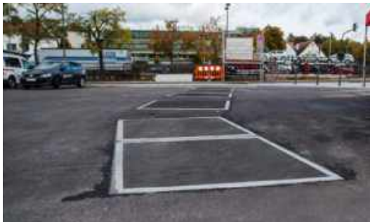
Backwater-proof covers filled with asphalt and with a load class of D400 – Ansbach