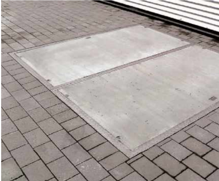
Two-piece shaft cover with concrete surface – Frankfurt