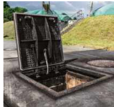
Surface-water-tight cast-iron cover with an opening aid, a load class of D400 and a clear opening of 1000 mm x 1000 mm – Munich