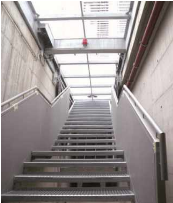
Escape hatch with a counterweight drive – Berlin