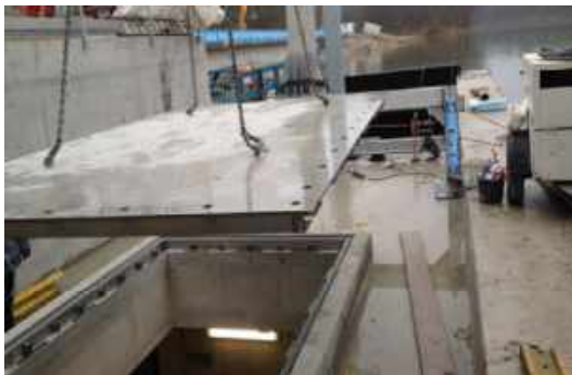
View from below of a floodproof cover on an assembly opening – power plant on the river Danube near Augsburg

ACO Detego's expert team are ready to answer your questions, our contact details are listed on page 27