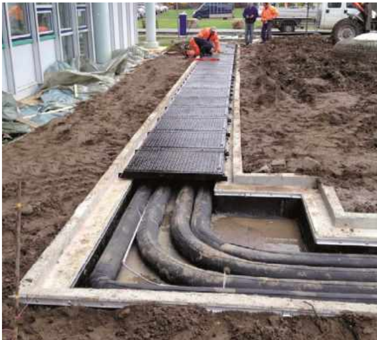
Series of cast-iron covers with a load class of B125 – Heidelberg