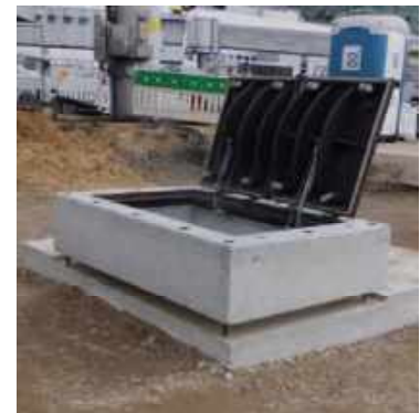
Prefabricated surface-water-tight cable shaft cover with a height-adjustable reinforced concrete frame – Düsseldorf