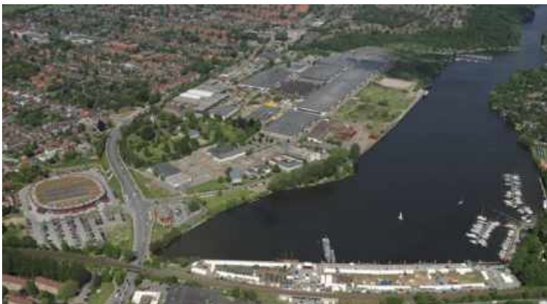
The headquarters of the ACO Group in Büdelsdorf, near Rendsburg