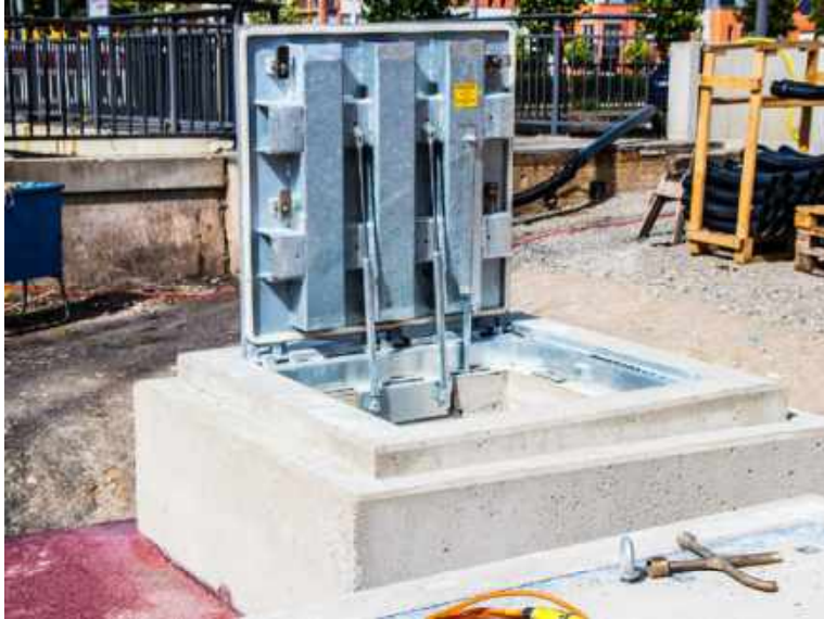
Manually actuated, backwater-proof cover with a load class of D400 and an opening aid

For a number of specific applications, shaft covers have to be floodproof, i.e. impervious to pressurised water (according to the pressure level/ overflow level) from the top down, or backwater-proof, i.e. impervious to pressurised water (according to the pressure level) from the bottom up. In these systems, appropriate measures have to be taken to ensure that the cover is fixed in place on the shaft and that the seal is impervious to pressurised water. We would be delighted to offer you a solution tailored to your specific application.