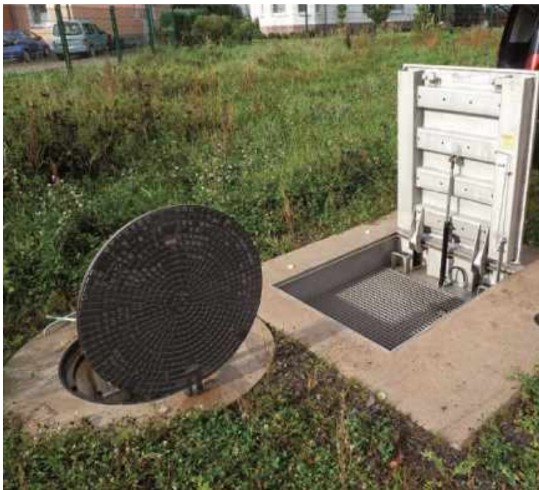
Combination: round cast-iron cover with hinge and an opening aid (on the left) and a stainless steel cover with an opening aid and safety grating (on the right)