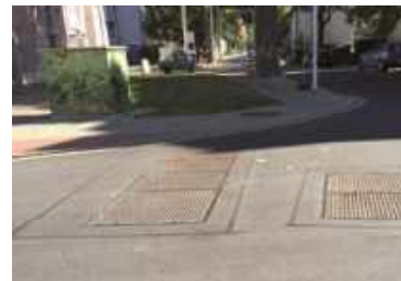
Series of cast-iron covers as a module cover and with a load class of D400 – Dresden