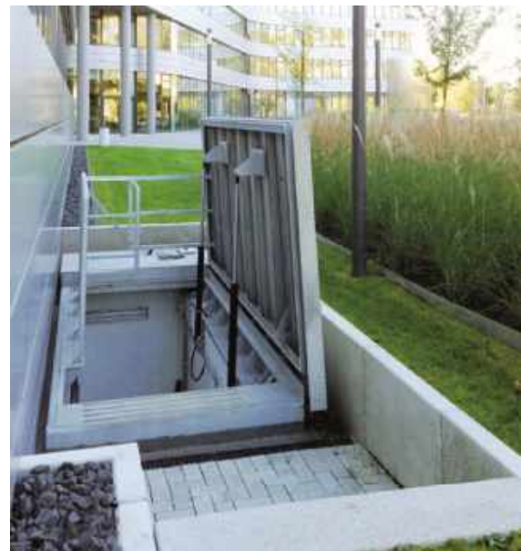
Hydraulic stainless steel escape hatch – Cologne