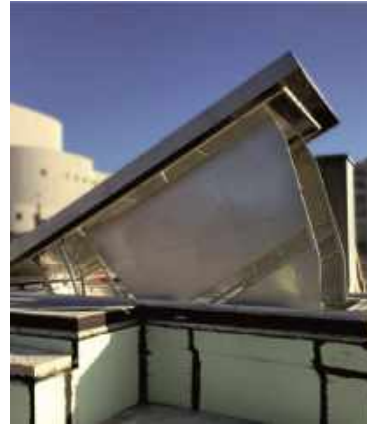
Hydraulic escape hatch cover – Düsseldorf