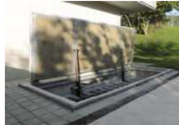
Hydraulic cover on a woodchip silo with a fire protection classification of F90 – Eisenstadt, Austria