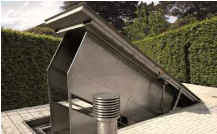
Pump station access – Seligenstadt