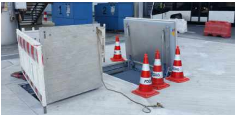
Access and assembly openings with a load class of F900 – Düsseldorf