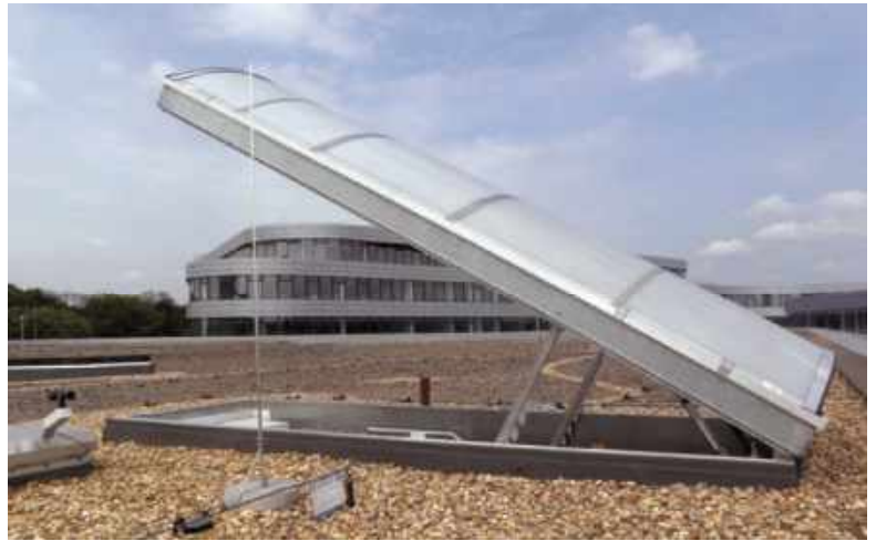
Hydraulic roof hatch and a damper for the smoke and heat venting system – Cologne